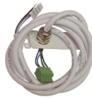
Power & Dimming Cord (5ft)